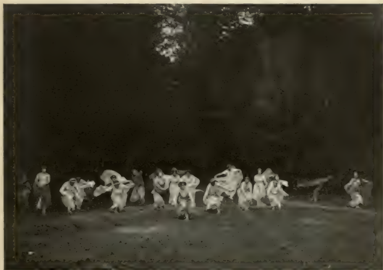
GROUPING AND MOVEMENT COMBINED ( Sylvia Decides —Dartmouth)